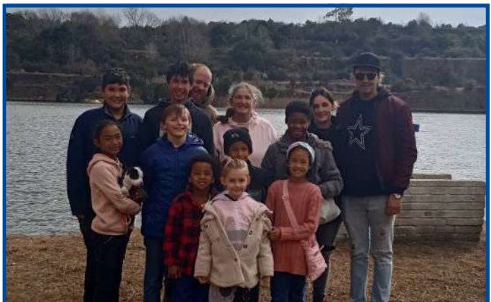
Bass Lake, Freediving Johannesburg and Scubaversity Dive Club held a charity Polar Bear Challenge on 15 July to raise funds for Galaxy Childrens Village, a local children's home.